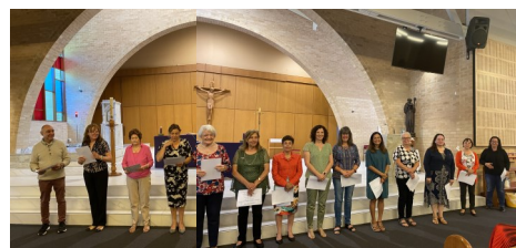
Catechist Commissioning last Sunday Mass